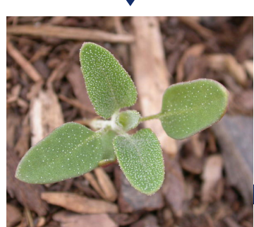
Once the true leaves develop, the distinction between these weeds becomes more evident. Lamb's Quarters has a more triangular-shaped leaf & no lobe on the leaf base.

Early in the season, Lamb's Quarters can be identified by the first one or two leaf pairs being opposite to one another.